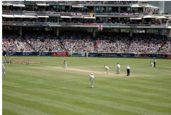
A Test match between South Africa and England in January 2005.

Test cricket is the highest standard of first-class cricket. A Test match is an international fixture between teams representing those countries that are Full Members of the ICC . Test matches between two teams are usually played in a group of matches called a "series" . Matches last up to five days and a series normally consists of three to five matches .