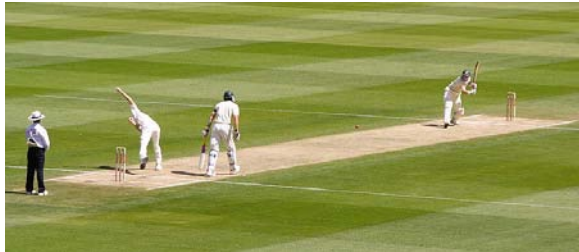
A bowler bowling to a batsman. The paler strip is the cricket pitch. The two sets of three wooden stumps on the pitch are the wickets. The two white lines are the creases.

Cricket is a bat-and-ball game played between two teams of 11 players on a field, at the centre of which is a rectangular 22-yard long pitch . One team bats , trying to score as many runs as possible while the other team bowls and fields , trying to dismiss the batsmen and thus limit the runs scored by the batting team. A run is scored by the striking batsman hitting the ball with his bat, running to the opposite end of the pitch and touching the crease without being dismissed. The teams switch between batting and fielding at the end of an innings .